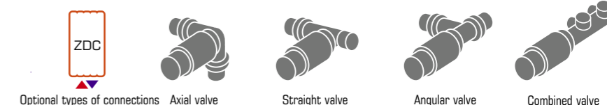
Optional types of connections